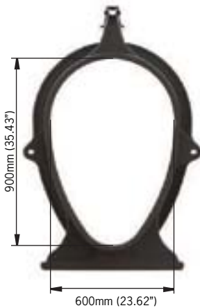
ACO Qmax 600