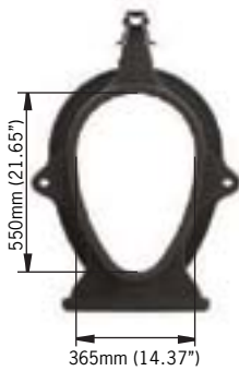
ACO Qmax 365

All reasonable care has been taken in compiling the information in this document. All recommendations and suggestions on the use of ACO products are made without guarantee since the conditions of use are beyond the control of the Company. It is the customer's responsibility to ensure that each product is fit for its intended purpose and that the actual conditions of use are suitable. ACO Polymer Products, Inc. reserves the right to change products and specifications without notice.