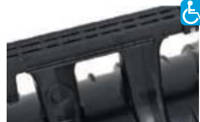
Q-Guard ductile iron ADA compliant tops

Patented Pavement Beam Feature allowing an unbroken reinforced slab to be cast around and through the inlet without interrupting the line of the inlet slot.