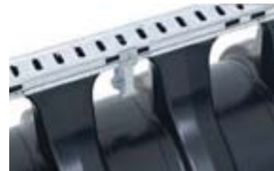
Q-Guard galv. steel tops

Choice of ADA compliant and high intake tops.