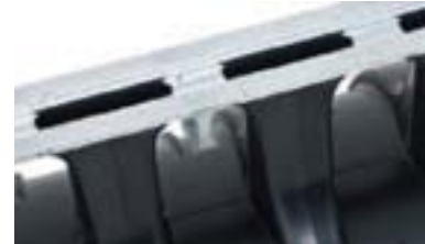
Q-Flow galv. steel high capacity tops