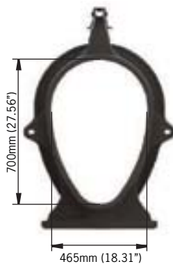
ACO Qmax 465